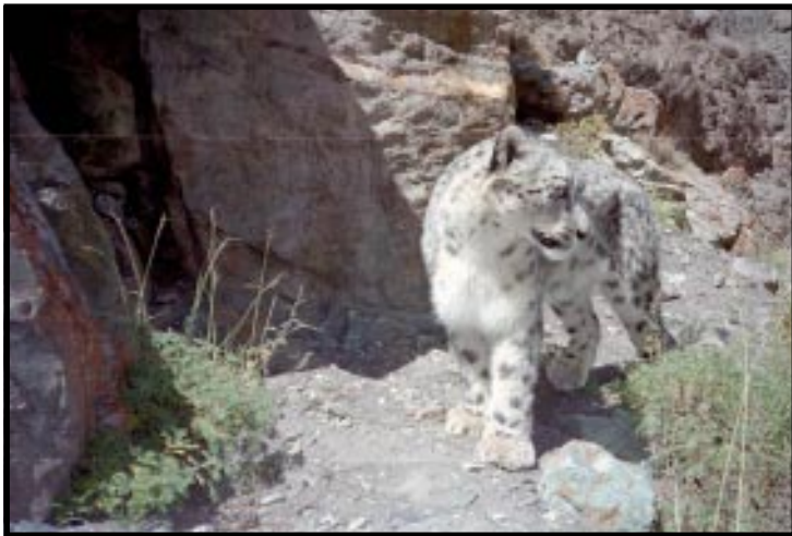
Wild snow leopard, Ladakh, winter 2003-2004

In 2003 we trained 24 new homestay providers and 11 new nature guides; expanded the program to 8 new areas in Ladakh; and implemented a community-based monitoring process. For information visit: www.Himalayan-Homestays.com