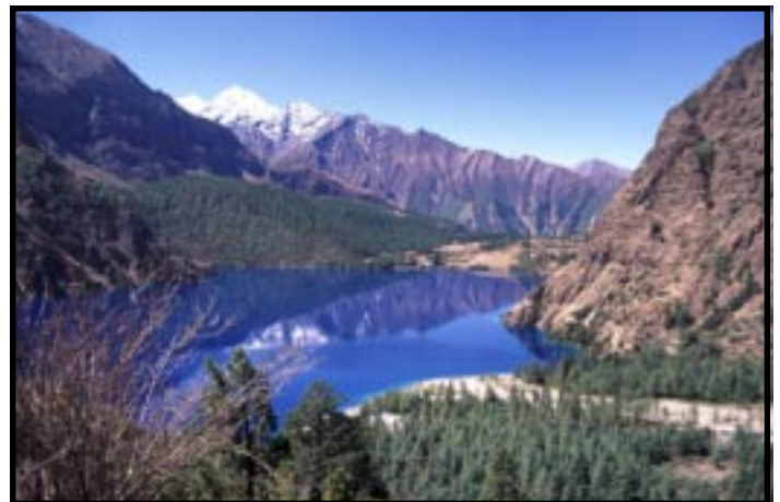
Ringmo Lake, Shey-Phoksundo National Park

Urban travel agents have traditionally captured the bulk of tourist income, but this program generates cash for villages close to wildlife areas.