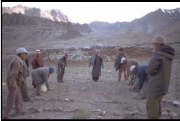
Ladakhi villagers lay out a new livestock corral