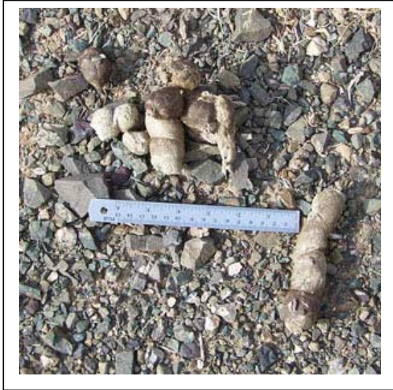
Figure 2. Snow leopard scat

Size and Configuration: Like other felids, snow leopards scats tend to be uniform in diameter (1.8 cm average diameter, comprised of several slightly constricted “cords” or connected blocky segments up to 8-10 cm). The scat usually has blunt ends, compared to canid scats that tend to be tapered on both or at least one end, of irregular diameter and without any obvious constrictions. Note, however, that snow leopards may also deposit small, fox-like or “token” scats.