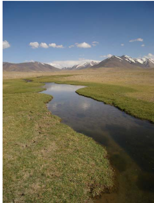
Typical landscape near Alichur