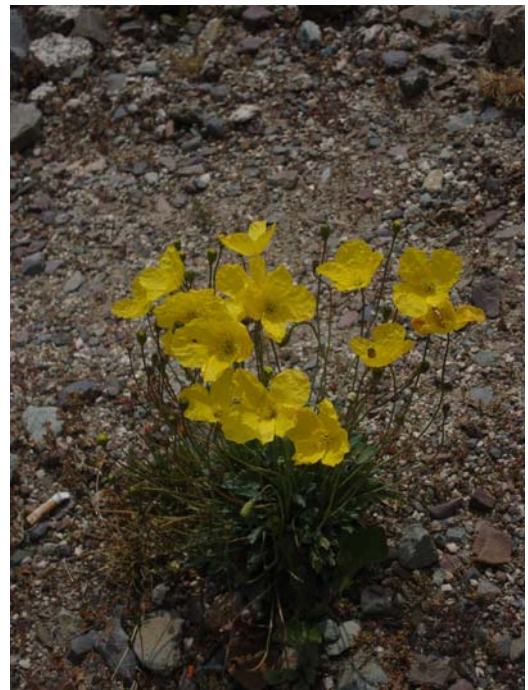
Yellow poppy – the Pamirs are rich in wildflowers