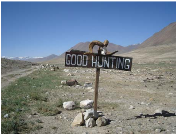
Murghab Hunting Company "welcome sign"