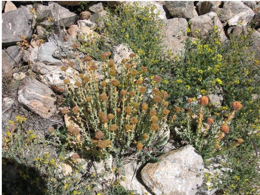
Radiola or the Golden Root.

This is one of the best plants in the area but it is disappearing. It is tasty for all animals, and especially good for milk animals