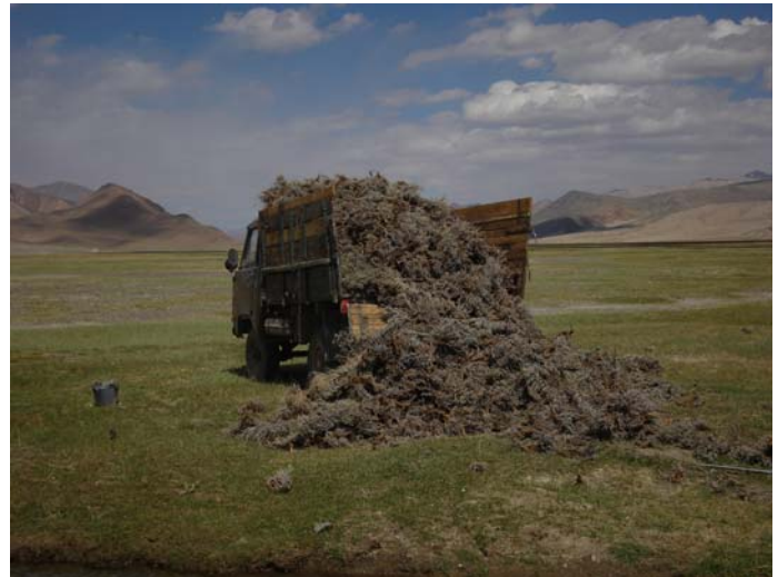
Teresken fuel supply – a rapidly disappearing resource