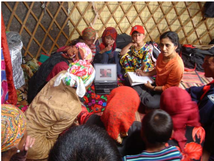
Women's group discussing pictures (Ak-Kalama)