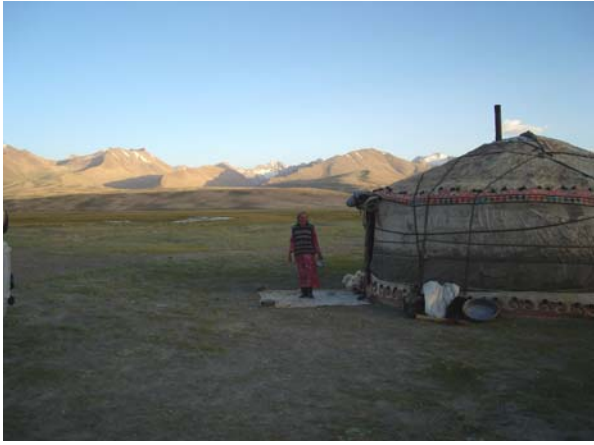
Herder's camp near Alichur