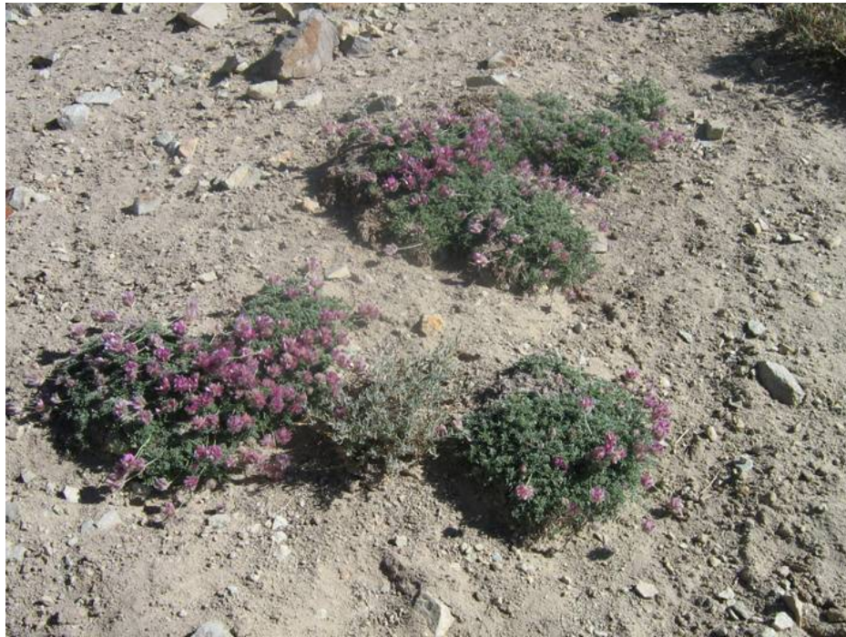
Kyzyl Burma ( Kyrgyz )

This is one of the best plants in the area but it is disappearing. It is tasty for all animals, and especially good for milk animals