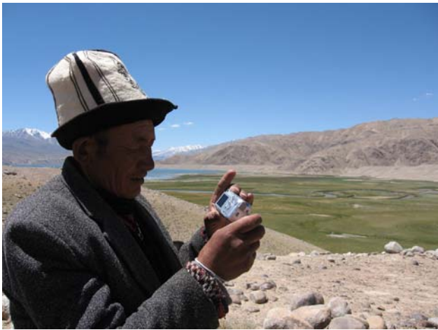
Bulunkul herder examining his digital pictures